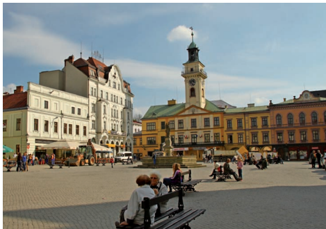
Fig. 2. A photo of two border towns divided by the Olza river: Cieszyn on the left, Český Těšín on the right side of the photo